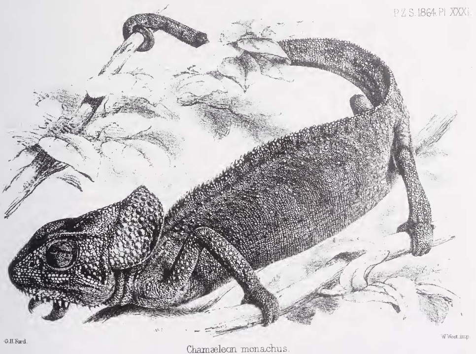
Fig. 2. Holotype (BM 1946.8.21.98) of Chamaeleo monachus Gray, 1865. Drawing from the original description: Gray 1865.